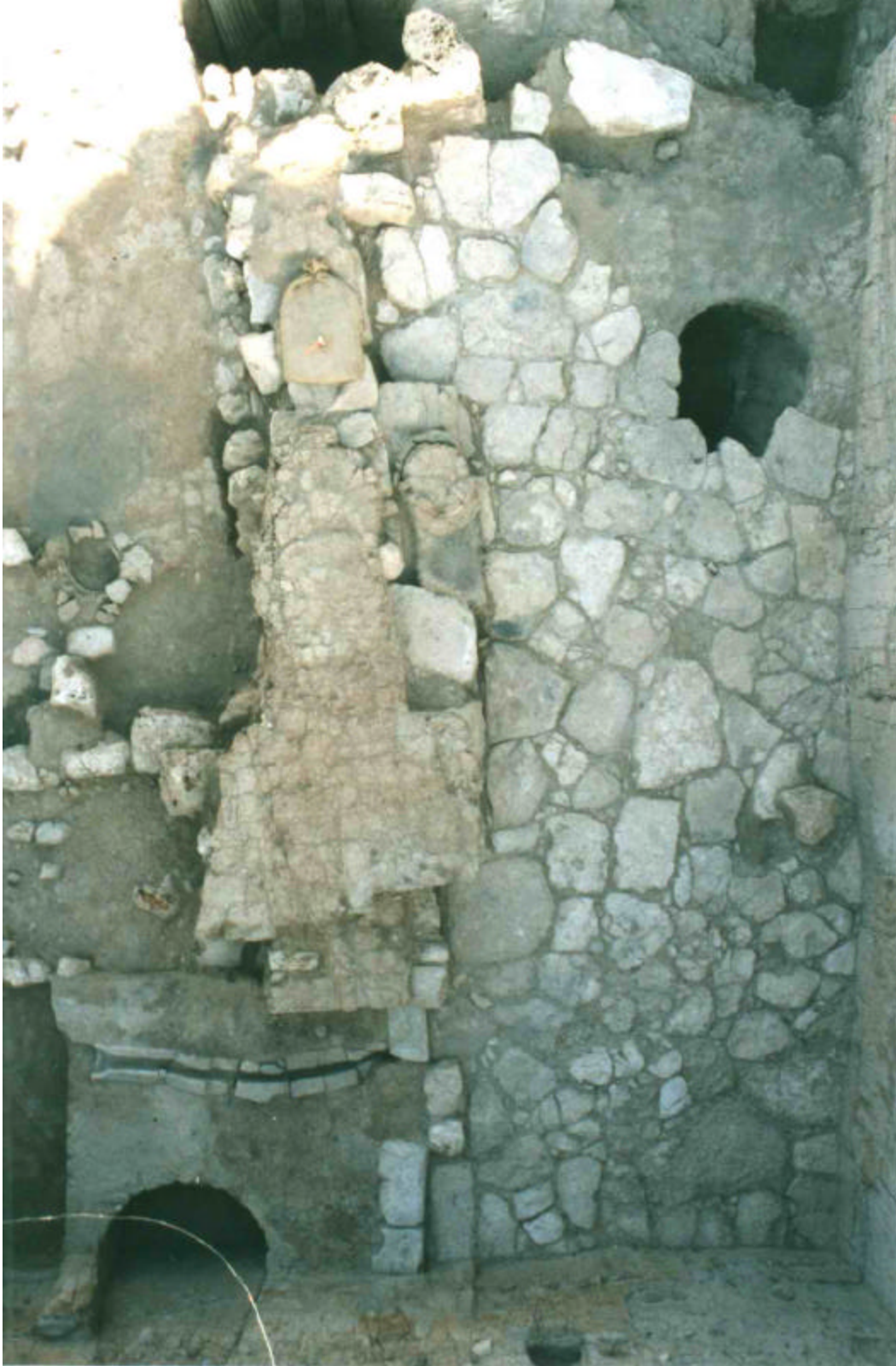
Fig. 3 Overhead view of paved courtyard H3 Photo V13d3046 G. Gallacci)